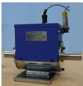
Inline Rotating Torque Sensors

IEICOS has the required expertise and knowledge with 38+ years of experience in torque technology to design and develop any torque measuring instrumentation for your needs. Please contact us with your application and we are sure to provide you with a torque solution that meets your needs. We also undertake research and development and consulting work with regards to torque measurement and application.